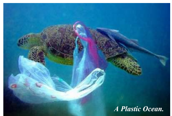
A Plastic Ocean.

There is also a selection of documentary screenings available at the Foxlowe this Spring with A Plastic Ocean on Wednesday March 7, followed by Tomorrow on Wednesday April 4. The documentaries are free admission with donations to the venue very welcome. There will be a licensed bar, hot drinks and a Fairtrade stall on offer at each screening when doors open at 7pm for 7.45pm start.