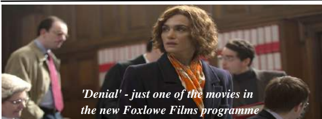
'Denial' - just one of the movies in the new Foxlowe Films programme

All Foxlowe Talks, which start at 7.30pm, are free admission with donations very welcome for the upkeep of the community venue.