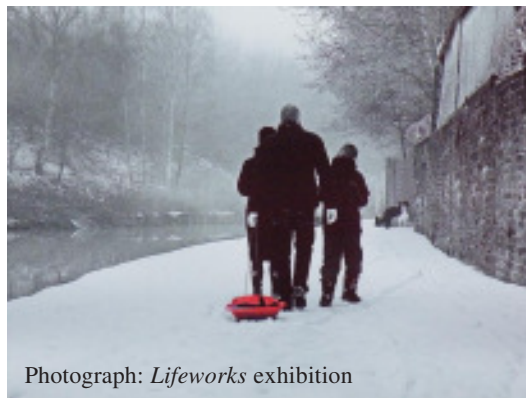
Photograph: Lifeworks exhibition

Dionne's work, with its tightly limited palette, engages with land and sky, blocks of strong colours, 'stitched' together by line, evoking her response to bleak empty landscape and its own testing beauty. The added interest in the exhibition is seeing these paintings placed with the work of her colleagues, with obvious signs of similarities in their different media.