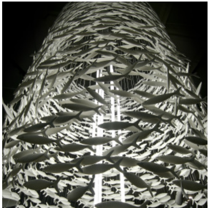
Useful and beautiful. SHOAL 1672 which inspired Rick & Jill Stein to commission a similar piece for their Padstow restaurant

Each shape is made individually, then wired into the installation, with the light source hitting, and reflecting, on the relief-shaped surfaces. An example of a light using amoeba-like form can be seen in their show room at 34 Stockwell street in Leek.